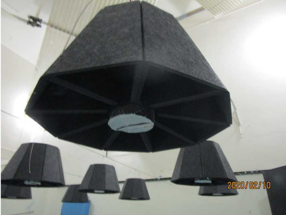
Figure 3 – Underside of individual fixture