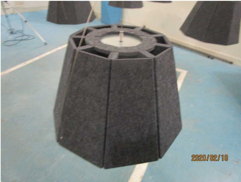
Figure 2 – Detail of individual fixture