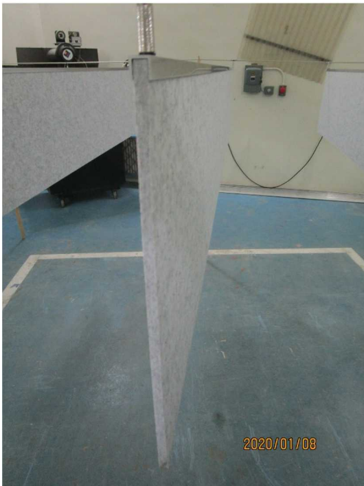
Figure 2 – Detail of individual baffle materials