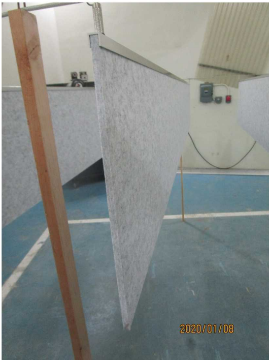
Figure 2 – Detail of individual baffle materials