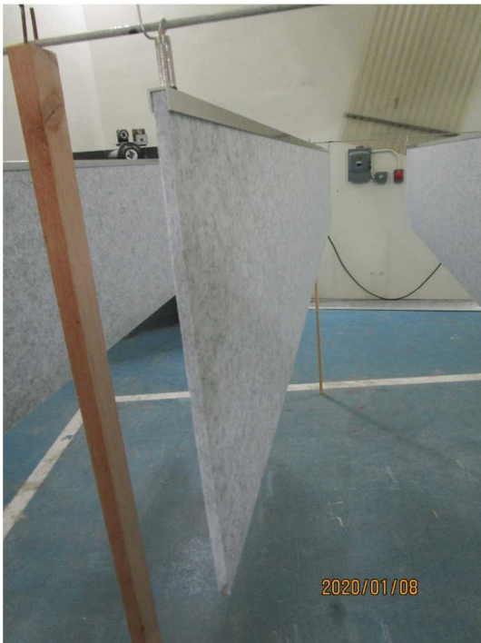
Figure 2 – Detail of individual baffle materials