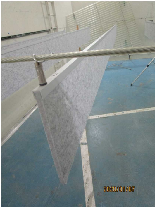
Figure 2 – Detail of individual baffle materials